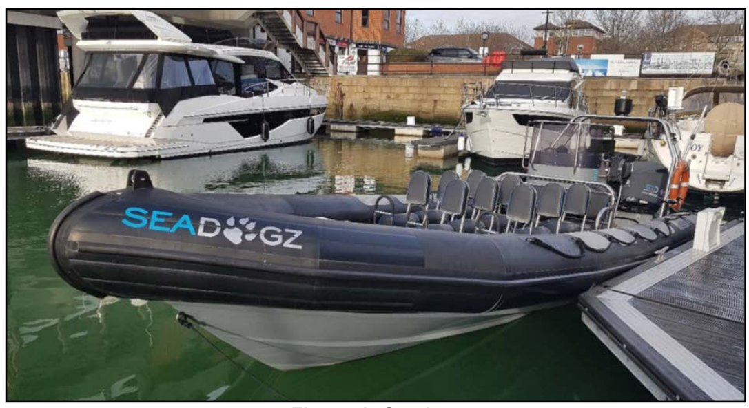
Figure 1: Seadogz

Seadogz Rib Charter Ltd owned and commercially operated two rigid inflatable boats (RIB), Seadogz (Figure 1) and Jack Black. The company offered a range of excursions using the boats within the Solent area, which included: Extreme RIB Experiences, Treasure Hunts, Corporate Team Building Events, and trips for Stag and Hen parties. Seadogz was approved to operate in area Category 4<sup>1</sup>, and its compliance with The Small Commercial Vessel and Pilot Boat Code of Practice (SCV Code) was verified by the Yacht Designers and Surveyors Association, a Maritime and Coastguard Agency (MCA) approved certifying authority.