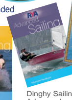
Dinghy Sailing Advanced Handbook